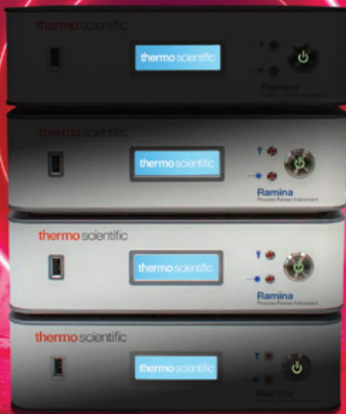
Ramina Process Analyzer