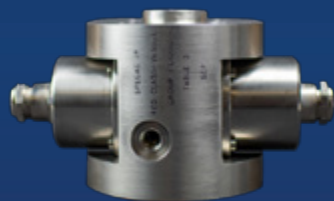
Vortex Flange-mounted liquid process cell

We are proud to play our part in the green transition of industrial chemistry with proven experience helping process operators stay safe and in control.