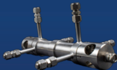
Typhoon Vapour Phase Process Flow Cell